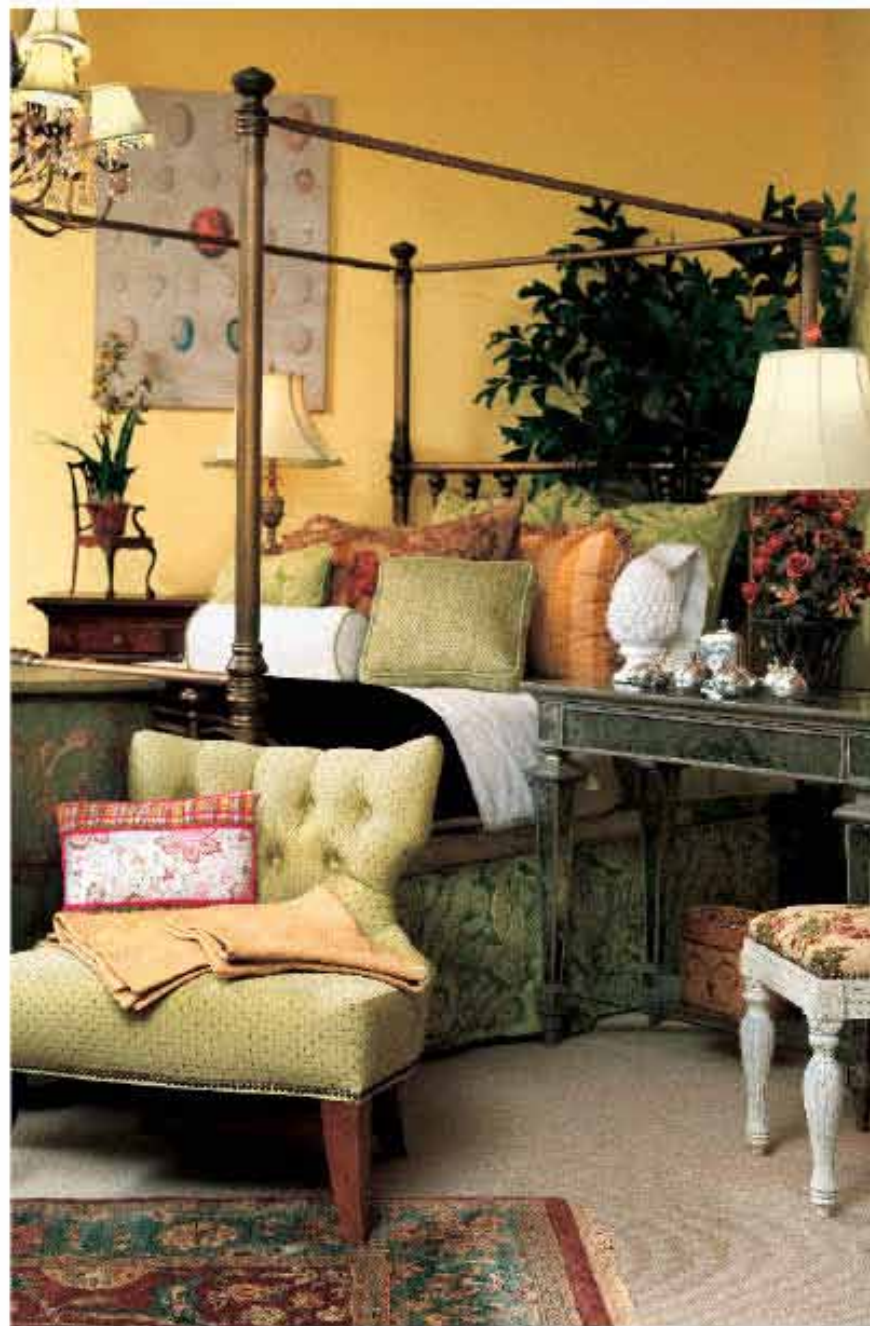
The floor is refreshed with an ever-changing selection of traditional, coastal, English Country and French Country gifts, furnishings and accessories. In recent years, with the addition of three interior designers, a flooring department and an expanding fabric and wallpaper library, Bountiful has earned a reputation as a one-stop shop for all interior design needs.

The look is ... "Long Island Stanford White ... cedar shingles, English or French countryside."