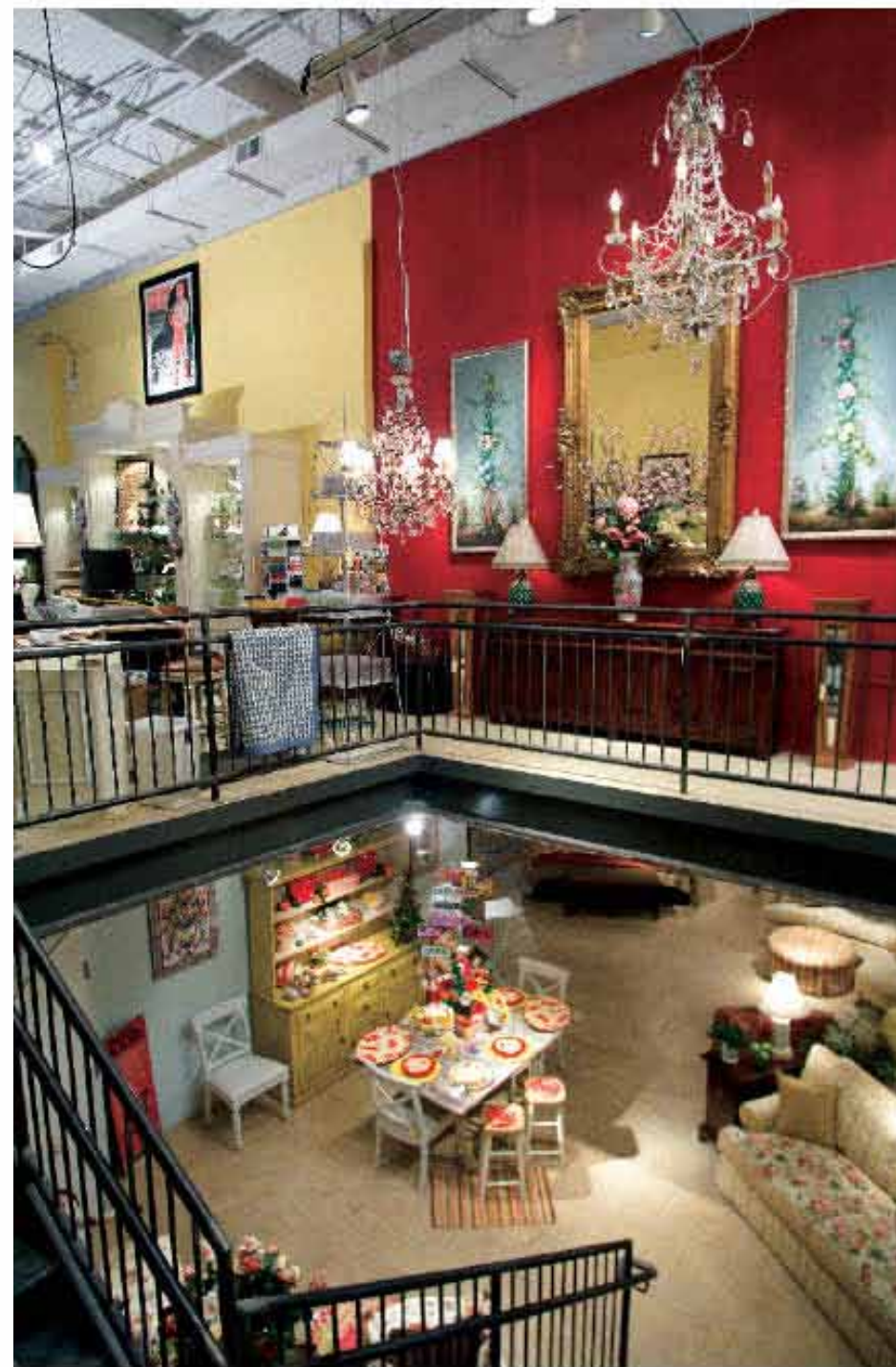
Merida merchandises the inventory in specialized "stores within a store" to increase Bountiful's appeal as a destination location for the area's second homeowners, retirees and weekend visitors. Chesapeake and coastal influences are depicted in crab, waterfowl and sailboat motifs and vintage nautical posters and signage.